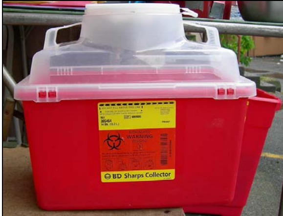
Image courtesy of Joe Mabel, photographer via Wikimedia Commons. Published under the terms of GNU Free Documentation License (GFDL). "Copyleft" granted by the photographer.