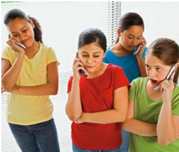
Source: Radiation and Cancer: A Need for Action.

Radiation exposure is increasing—particularly in industrialized countries—raising the risk of radiation-induced cancers. This course encompasses both ionizing radiation and non-ionizing radiation, and the links of these exposures to cancer.