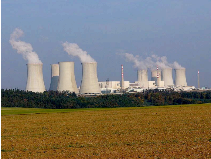
Nuclear power plant.