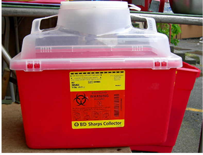
Source: Image courtesy of Joe Mabel, photographer, via Wikimedia Commons. Published under the terms of GNU Free Documentation License (GFDL). "Copyleft" granted by the photographer.