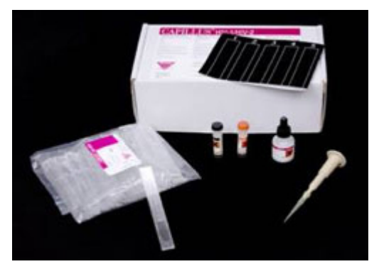
Contents of the CAPILLUS HIV-1/HIV-2 Rapid Test Kit that tests whole blood, serum, or plasma.

Currently there are only two home HIV tests: OraQuick In-home HIV test and the Home Access HIV-1 Test System. If you buy your home test online make sure it is FDA-approved (CDC, 2013b).