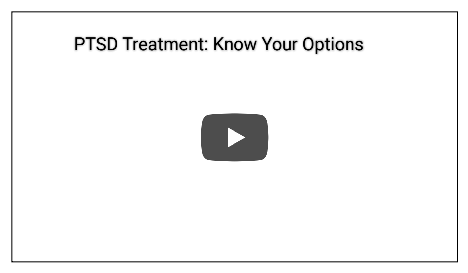
PTSD Treatment: Know Your Options. https://www.youtube.com/watch? v=FeLLt39DI8A

The preeminent treatments for people with PTSD are medication, psychotherapy ("talk therapy"), or both. Because everyone responds to trauma and stress uniquely, a treatment that works for one person may not work for another. It is important for anyone with PTSD to be treated by a mental health provider who is experienced with PTSD. People with PTSD may need to try a variety of treatments to find what works best for them.