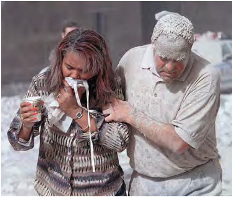
Man covered with ashes assisting a woman who is holding a particle mask to her face following the September 11 terrorist attack on the World Trade Center, New York City.

The effects of terrorist acts are not only physical, and fear may loom large among citizens. Healthcare workers need to be prepared to address this fear, even in patients who have sustained little or no physical injury. Additional psychological effects are recognized consequences of certain types of injuries and will be discussed in the sections that follow.