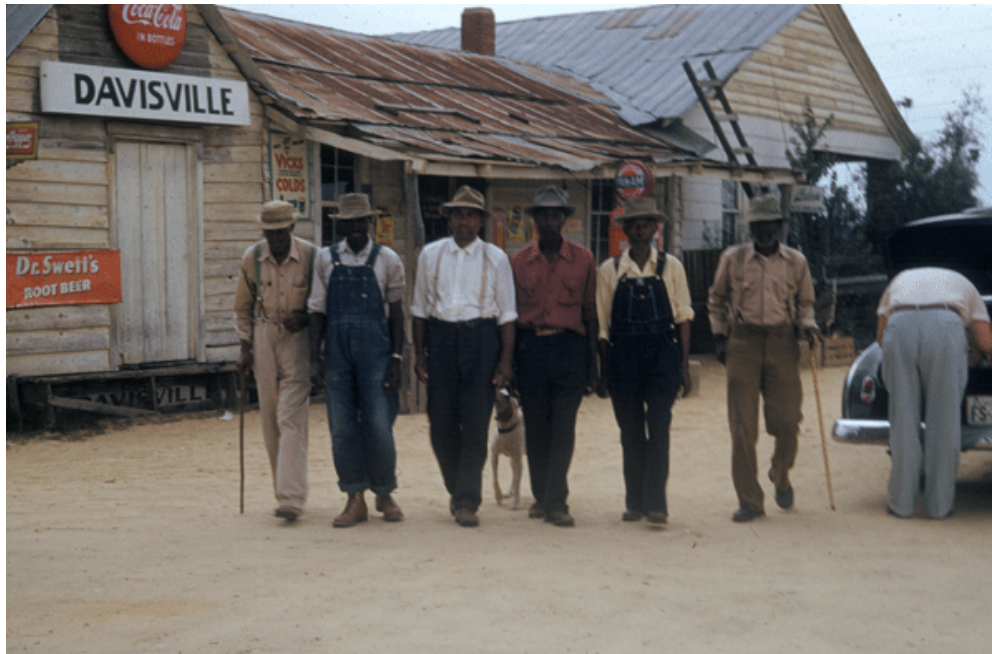
Group of men who were test subjects in the Tuskegee Syphilis Experiments.