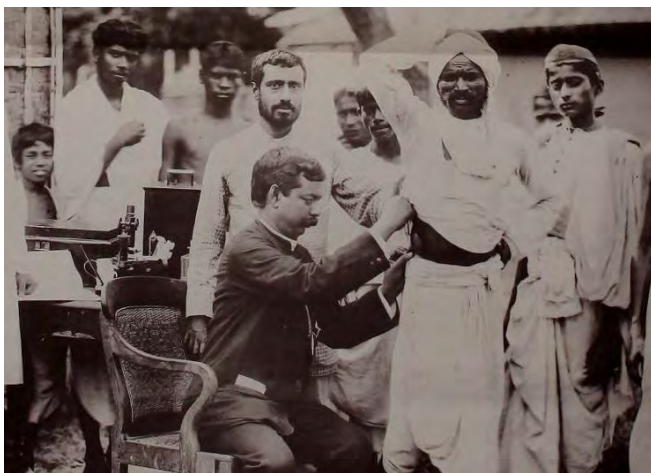
Anti-cholera vaccination, Calcutta, 1895.

While colonial physicians and scientists made substantial contributions to medicine, they worked almost entirely on health issues that were unique to the colonies. In doing so, they established a focus on infectious diseases exclusive to the colonies—an interest that has been inherited by global health today (Global Health 50/50, 2020).