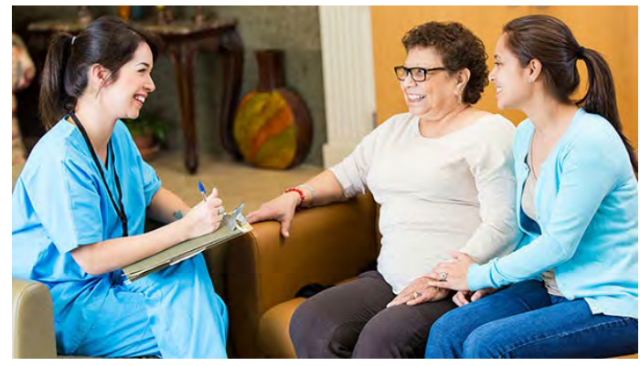
A bilingual doctor discussing health issues with a patient and her daughter.